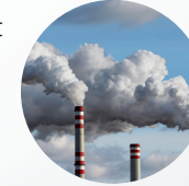
Outdoor air pollution