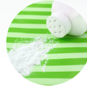
Talc-based body powder