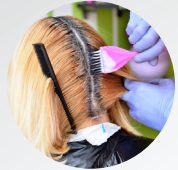
Hair coloring products