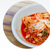
Pickled vegetables (traditional in Asia)