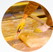
Insulation glass wool