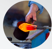
Art glass, glass containers and pressed ware (manufacture of)