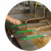
High temperature frying