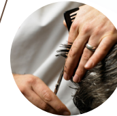
Working as a barber/hair dresser