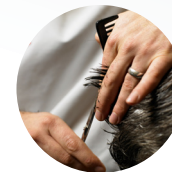
Working as a barber/hair dresser