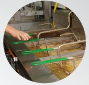
High temperature frying